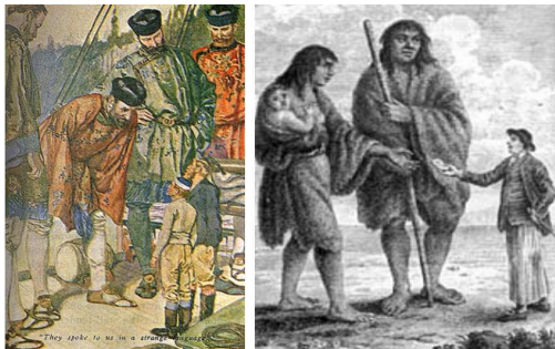
(Above left) Giants of Russia as early sailors of the 1700s described them also telling stories of their strange language and elaborate clothing. (Above right) A sailor giving a Patagonian woman some biscuit for her child. The frontispiece for John Byron's travel epic, A Voyage around the World (1767). Image from Patagonia: Natural History, Prehistory and Ethnography at the Uttermost End of the Earth.

Oliver Van Noort, the first Dutchman to attempt a voyage round the world, between the years 1598 and 1601, gives the account of the inhabitants of these parts "He went up the river at Port Desire, and going on shore, found beasts like stags and buffaloes, also some savages, who, he says, were tall portly men, painted and armed with short bows and arrows, that were headed with stone.