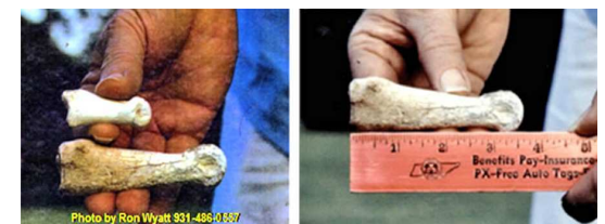
(Above left) shows a normal human thumb bone from an adult male of 6 feet tall with the large thumb bone shown below. (Above right) the large thumb bone measures 3.6 inches, the thumb bone from the 6 foot tall adult measures 1.5 inches. Estimates are that the giant thumb bone belonged to a person who would have stood at around 12 feet tall.

Another discovery made by the archaeologist Ron Wyatt, was a giant thumb bone found in the lesser mounts of Ararat near Noah's Ark, Eastern Turkey in 1982.