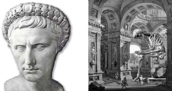
(Above left) Augustus was born Gaius Octavius on 23 September 63 BC in Rome. In 43 BC his greatuncle, Julius Caesar, was assassinated and in his will, Octavius, known as Octavian, was named as his heir. He fought to avenge Caesar and in 31 BC defeated Antony and Cleopatra at the Battle of Actium. He was then the undisputed ruler of Rome. (Above right) Artist's reconstruction of Augustus Caesar's 'Roman Mystery Museum' showing the skeleton of a giant hero as its centrepiece.

When he became Emperor of Rome, Augustus Caesar (63 BC-14 AD) established the world's first palaeontological museum at his villa on the island of Capri. It housed a collection of the bones of immense monsters of land and sea. According to some texts the main hall of Augustus's museum had a centre piece which set it apart from any other in history, apparently boasting the skeletal remains of a one hundred foot tall Titan along with the weapons of the ancient heroes.