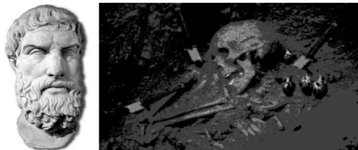
(Above left) Philodemos of Gadara, the Syrian Epicurean who was by all appearances housed in the villa of his influential patron L. Calpurnius Piso at Herculaneum. Epicureanism is a system of philosophy based upon the teachings of Epicurus (c. 341-c. 270 BC), founded around 307 BC. Epicurus was an atomic materialist, following in the steps of Democritus. Pictured is the philosophers likeness. English: Marble bust of Epicurus. Roman copy of Greek original, 3rd century BC/2nd century BC. On display in the British Museum, London. (Above right) Artists reconstruction of the giant unearthed in Crete.