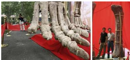
(Above left) A photograph of what was reported to be the left foot with missing ankle and toe bones. (Above right) Visitors look at an eleven foot tall bone on display in Zhengzhou, in China's central Henan Province. Parts of the 18 meter dinosaur were exhumed and eaten by locals as traditional medicine. Photographs by Donald Chan/Reuters, July, 03, 2007.

Dino Black Market Fuels Peasant-Police Combat in China, Kevin Holden Platt in Beijing for National Geographic News, November 27, 2007.