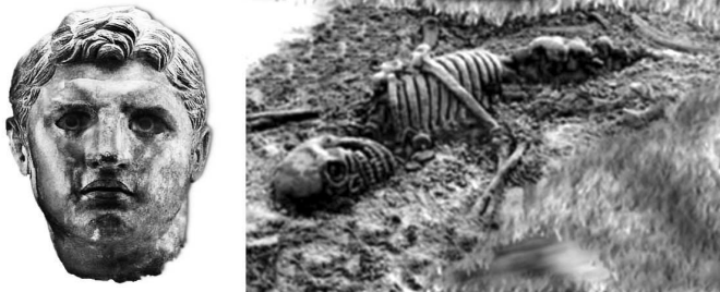
(Above left) Gaius Julius Solinus, Latin grammarian and compiler, scholar Theodor Mommsen dates him to the middle of the third century. He was the author of De mirabilibus mundi ('The wonders of the world') which circulated both under the title Collectanea rerum memorabilium ('Collection of Curiosities'), and Polyhistor; but the latter title was favoured by the author.

During the Roman war against the Cretan pirates (106-66 BC), a tremendous thunderstorm caused rivers to flood. After the high waters receded, says the ancient historian Gaius Julius Solinus, the river banks collapsed, laying bare a skeleton said to measure 33 cubits (49.5 feet). Word reached the Roman commanders Metellus Creticus and Lucius Flaccus, who broke from their conflict with the pirates to investigate this marvel for themselves.