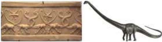
(Above left) Mesopotamian (Uruk, Biblical Erech) cylinder seal, compelling evidence that dinosaurs lived with men and were part of God's creation. (Above right) Artists impression of Barosaurus.

A Mesopotamian cylinder seal from around 1,520 BC, the Biblical period of Job, shows creatures intertwining their tails and necks, their anatomies as depicted seem identical to today's representations of dinosaurs such as Barosaurus, Nemegtosaurus and Pleurocoelus.