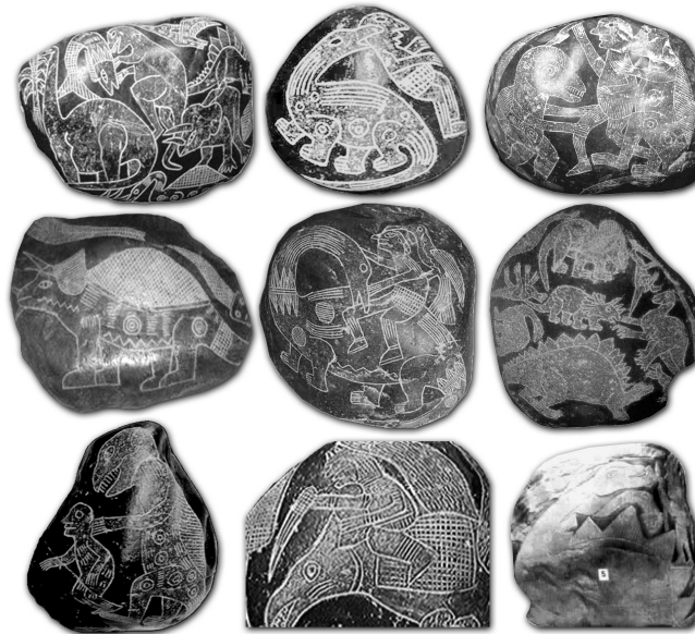
(Above) Some of the stones are too large to easily fit on the museums shelving and others are the size of boulders and must sit on the floor. Every room in the museum is filled with partitions full of shelving that are laden with stones. Most of the stones are sorted by category or theme.