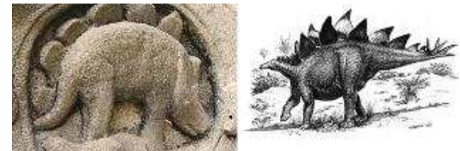
(Above Left) Zoomed image of Cambodian temple relief at Angkor Wat. (Above right) Stegosaur stenops image from Palaeos.com.

In the jungles of Cambodia are elaborate temples and palaces from the Khmer civilization. One such temple known as Ta Prohm holds stone statues and reliefs. These depict familiar animals such as monkeys, deer, water buffalo, parrots, and lizards. However, one column contains a carving of a creature which looks similar to stegosaurus. Artisans are thought to have decorated these builds more than 800 years ago. Western science only began assembling dinosaurs skeletons in the past two centuries.