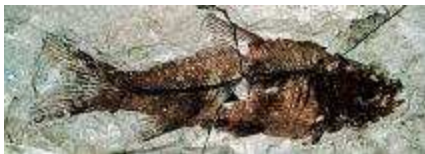
(Above) Rapid burial of a fish, http://www.icr.org/fossilization/

The characteristics of all dinosaur remains indicate rapid burial in a catastrophe such as Noah's flood, around 4,400 years ago.