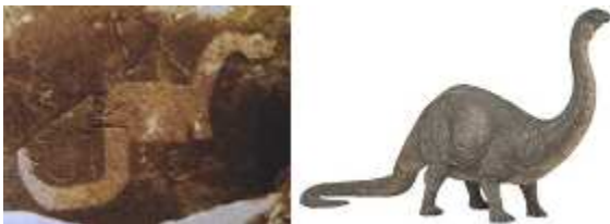
(Above left) Anasazi Indian Natural Bridges National Monument Petraglyph. (Above right) Artists impression of apatosaurus.

"There is a petroglyph in Natural Bridges National Monument that bears a startling resemblance to a dinosaur, specifically a Brontosaurus, with a long tail and neck, small head and all."