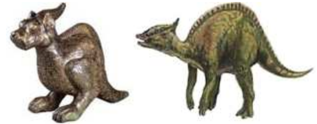
(Above left) Dragon artefact from the Shang dynasty extending from 1766 to 1122 BC. Advertised on the Chinese antiquities market as a dinosaur depiction. It displays relief lines in a scale-like pattern, a broad beak, a dermal frill, and a head-crest that is strikingly like the dinosaur Saurolophus (Above right). This jade statue, now in the Genesis Park collection, is made of white coloured nephrite with differential weathering demonstrating authenticity.

Asian stories and stylized dragon depictions are common. An unusual beaked dragon statue came up on the antiquities market and is now in the Genesis Park collection. The bronze styling on this artifact suggests it is from the Zhou Dynasty 1122 B.C. - 220 B.C. Or possibly from the Han Dynasty 206 B.C. - 220 A.D. It displays numerous characteristics of beaked dinosaurs such as the oviraptor, tridactyl feet, metatarsal stance, scale-like representation all over the body apart from the horn which has a striated pattern, long thin tail, elaborate head crest and a long neck.