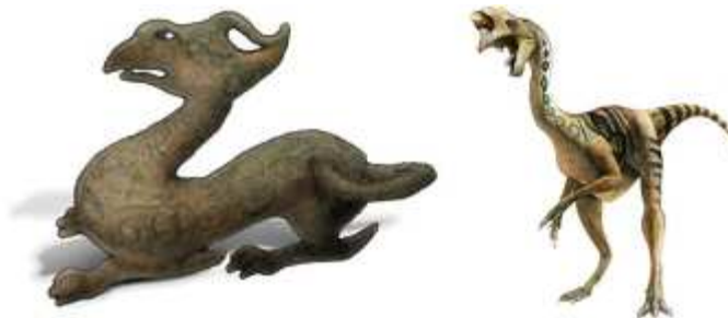
(Above left) Zhou Dynasty Chinese bronze dragon. (Above right) Artists impression of an Oviraptor placed by evolutionists within the conceptual late Cretaceous period 100 - 65 million years ago. Britannica encyclopaedia.

Asian stories and stylized dragon depictions are common. An unusual beaked dragon statue came up on the antiquities market and is now in the Genesis Park collection. The bronze styling on this artifact suggests it is from the Zhou Dynasty 1122 B.C. - 220 B.C. Or possibly from the Han Dynasty 206 B.C. - 220 A.D. It displays numerous characteristics of beaked dinosaurs such as the oviraptor, tridactyl feet, metatarsal stance, scale-like representation all over the body apart from the horn which has a striated pattern, long thin tail, elaborate head crest and a long neck.